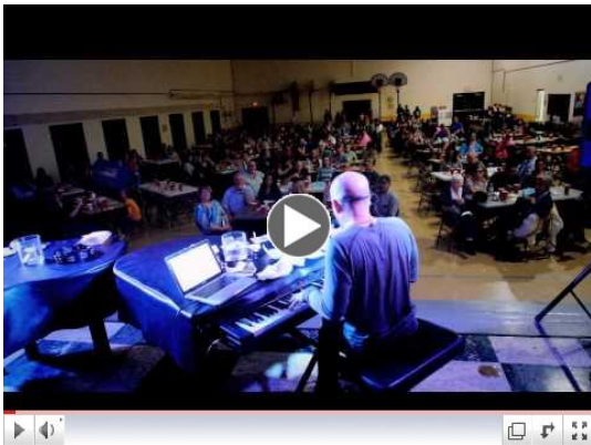
Killer Keyz Promotional Video