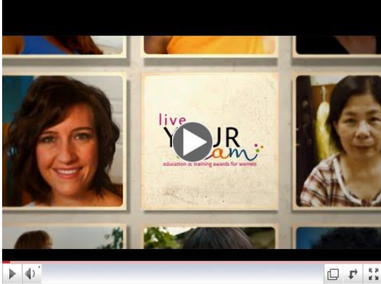
Live Your Dream