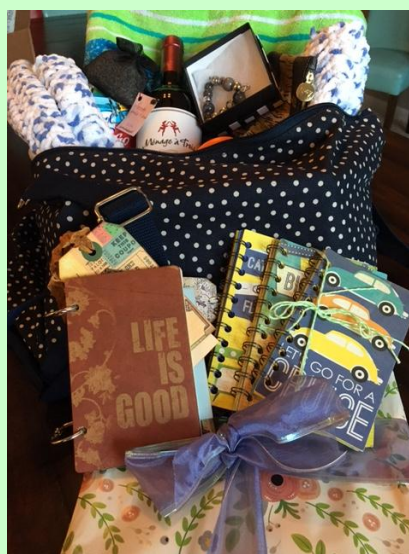
Basket compliments of the Special Events Committee