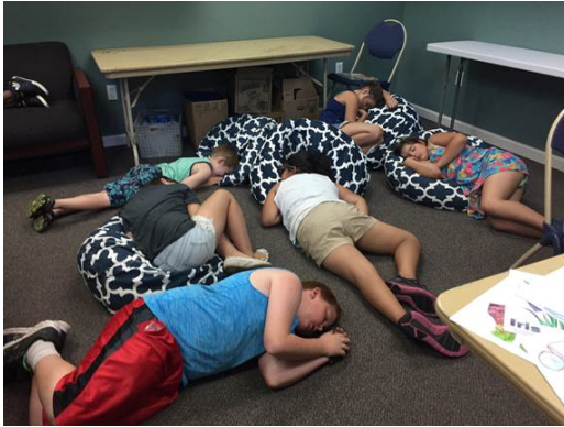
Soroptimist Serenity Room

With the end of the school year kids are tired and find another transition tough to manage. Check out what happened yesterday.