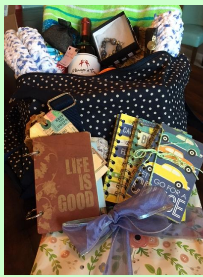
Basket compliments of the Special Events Committee

Click here to find out what's in the basket