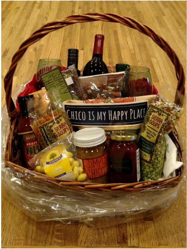
April's raffle basket is brought to you by the Service Committee

Below is a list of Above & Beyond Soroptimist volunteers that have