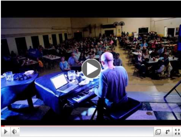
Killer Keyz Promotional video

surrounded by wine and apples in October. I have to say Soroptimist sure do know how to have fun.