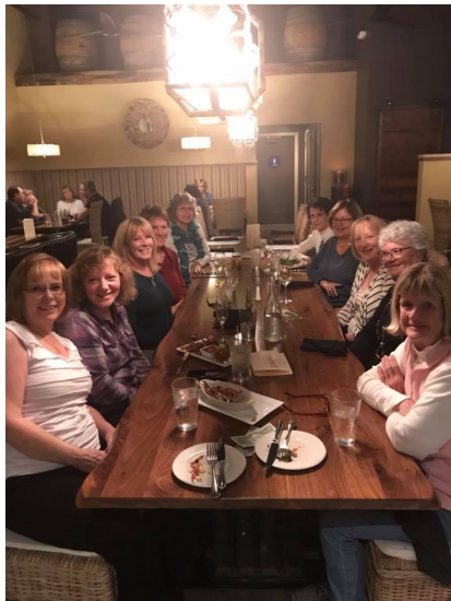
March 8th SUDS at Unwined