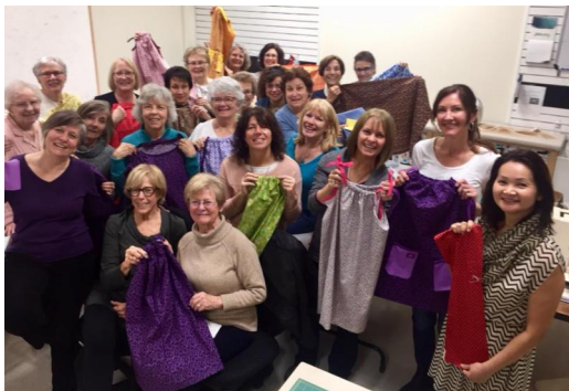
Soroptimists having fun at our first Dress A Girl Party

every one of you for being members of SI Chico.